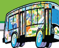
Bus Tour both days (Vallejo and Mare Island)