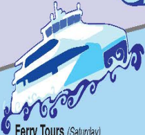
Ferry Tours (Saturday) Entertainment Cruise (Sunday)