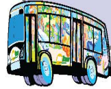
Bus Tour both days (Vallejo and Mare Island)