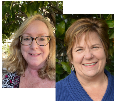
Member Spotlight- F-SUTA Pg. 7